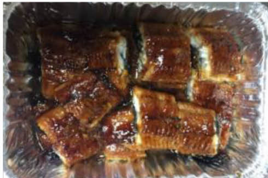
S09 烤鳗鱼 BBQ EEL