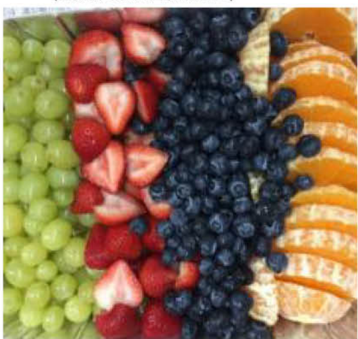
F03 水果拼盘 3 FRUIT PLATE 3 (图参考, 实物以当季水果为主)