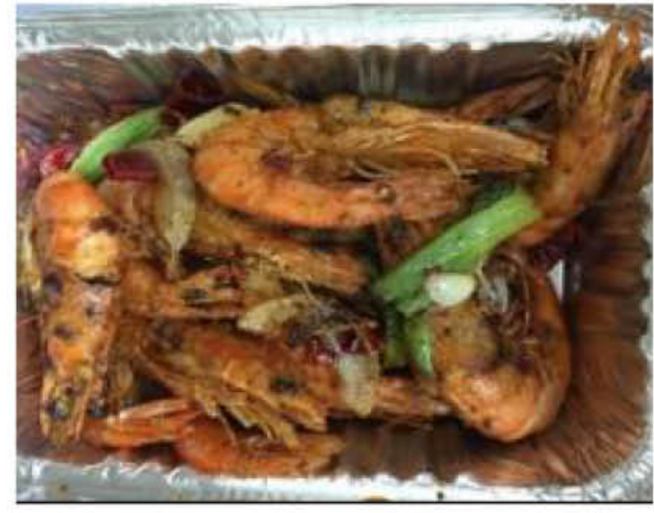
S18 香辣大虾 SPICY SHRIMP