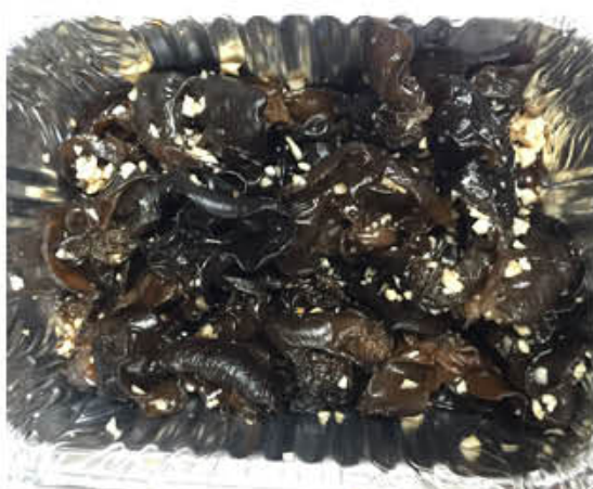
V37 凉拌木耳 WOOD EAR SALAD