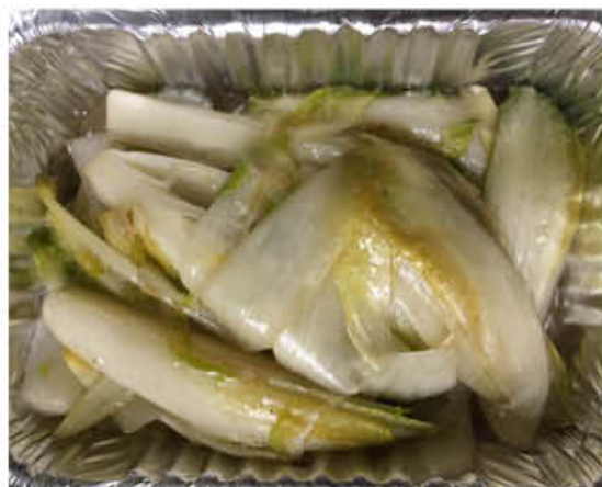
V09 醋溜白菜 NAPA CABBAGE WITH VINEGAR