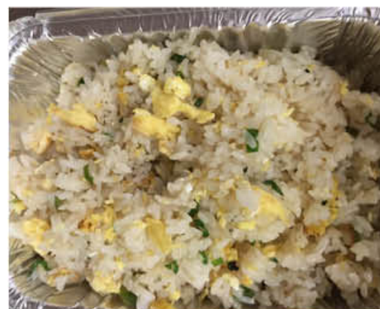
A03 炒饭 FRIED RICE