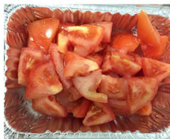
V38 凉拌西红柿 TOMATO SALAD