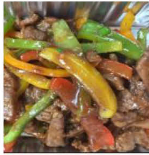
M06 彩椒牛柳 BELL PEPPER WITH BEEF