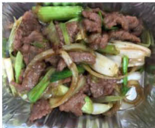
M03 葱爆羊肉 FRIED LAMB WITH GREEN ONION