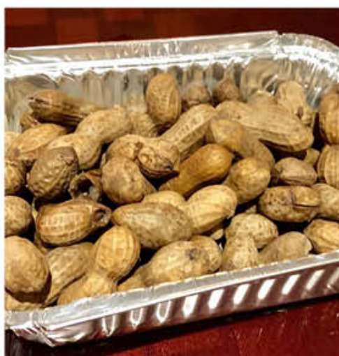
V31 五香花生 SPICED PEANUTS