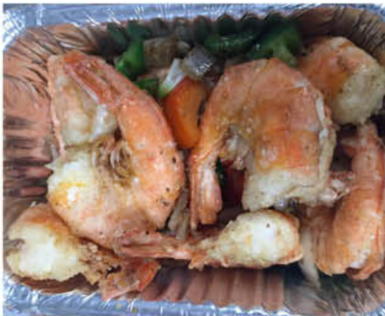
S19 椒盐虾 (去皮/带皮) SALT & PEPPER SHRIMP (PEELED/ WITH SHELL)