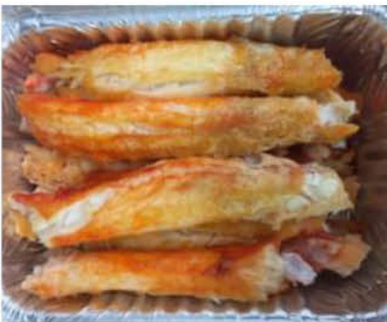
S05 帝王蟹腿 (去壳) KING CRAB LEG (PEELED)