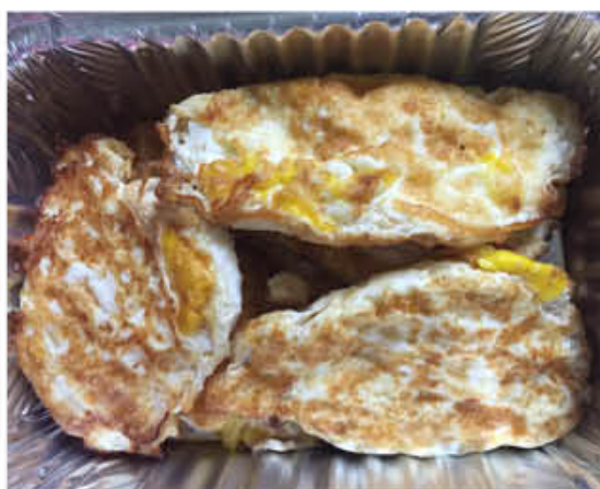
A01 鸭蛋 / 煮 / 煎鸡蛋 DUCK EGGS/ BOILED/FRIED EGGS