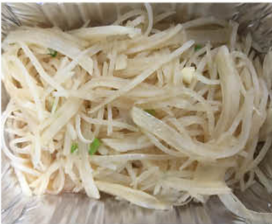
V05 清炒土豆丝 STIR FRIED SHREDDED POTATOS