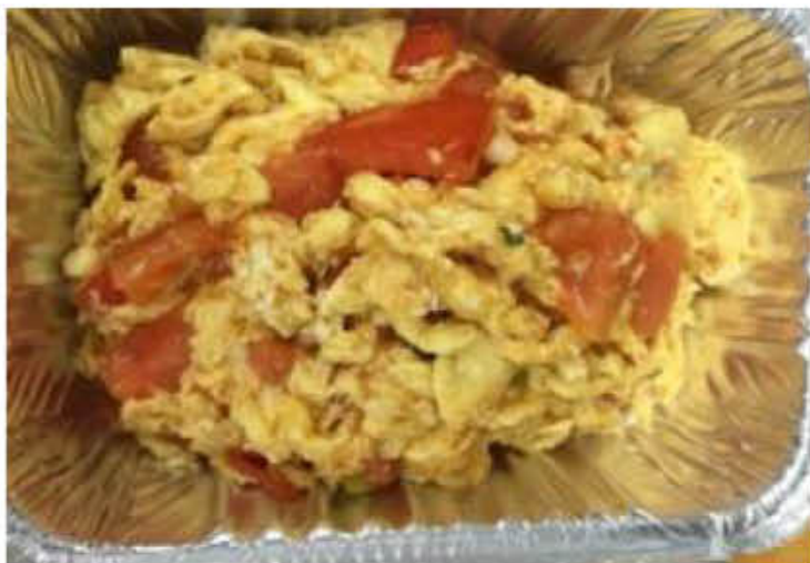
V26 番茄炒鸡蛋 SCRAMBLED EGGS WITH TOMATO