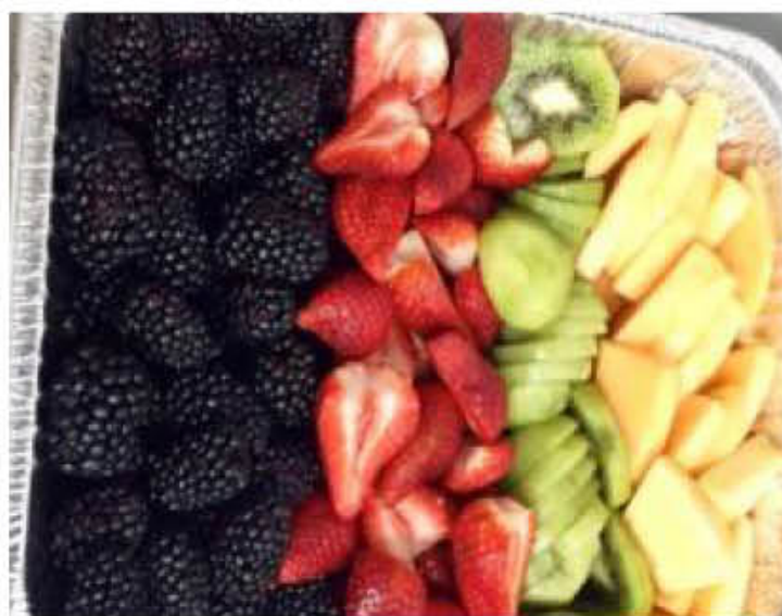
F02 水果拼盘 2 FRUIT PLATE 2 (图参考, 实物以当季水果为主)