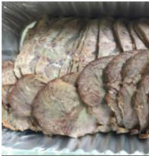
M05 酱牛肉 SPICED BEEF