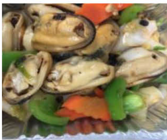
S12 豆豉青口 MUSSLES WITH BLACK BEAN SAUCE