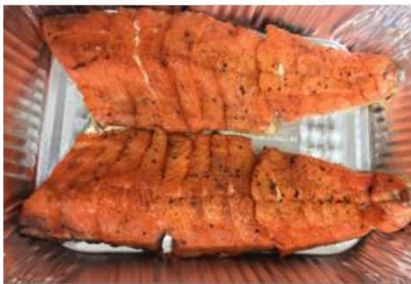
S08 香煎三文鱼 PAN FRIED SALMON