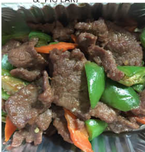
M07-1 尖椒牛肉 HOT PEPPER BEEF