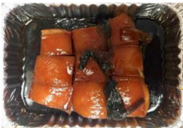
M11 东坡肉 DONG PO PORK