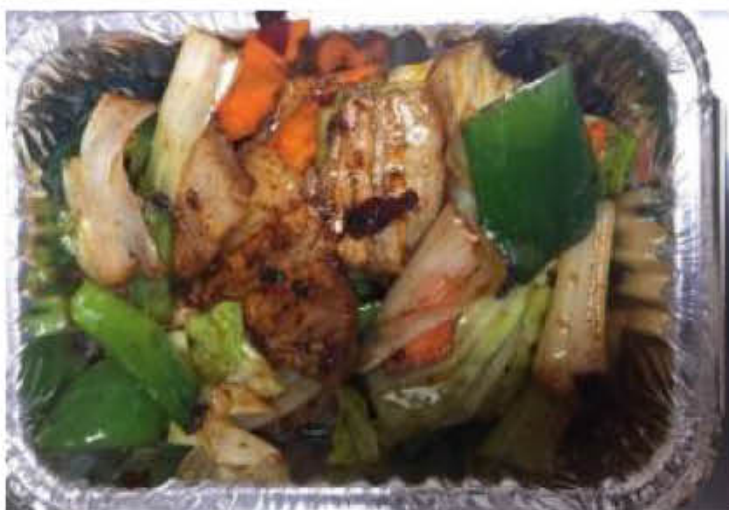
M09 回锅肉 TWICE COOKED PORK