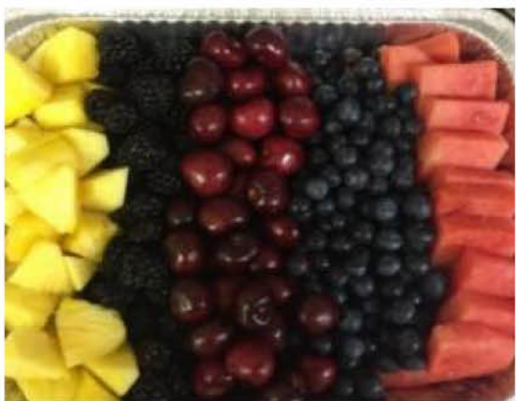
F01 水果拼盘 1 FRUIT PLATE 1 (图参考, 实物以当季水果为主)