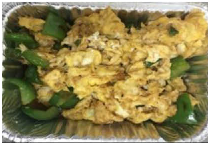
V27 青椒炒鸡蛋 SCRAMBLED EGGS WITH GREEN PEPPER