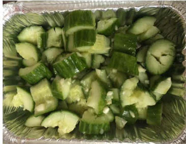
V04 拌黄瓜 CUCUMBER WITH GARLIC SAUCE