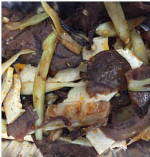
M05 搅合搅合 (SPICY BEEF WITH BEEF TRIPE & PIG EAR)