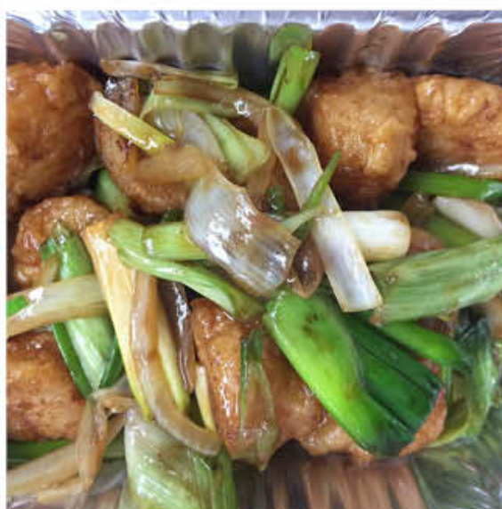
S10-1 红烧比目鱼 HALIBUT IN BROWN SAUCE