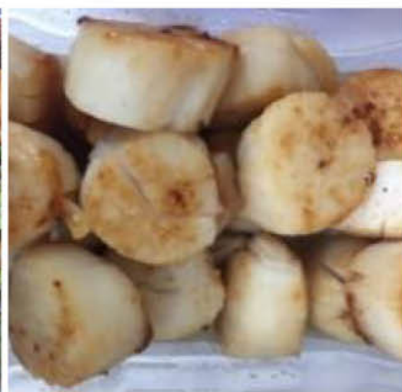
S11 香煎鲜贝 PAN FRIED SCALLOP