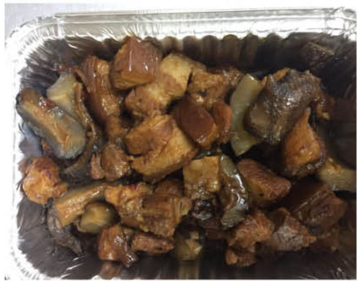
S16 红烧肉海参 BRASIED SEA CUCUMBER WITH PORK