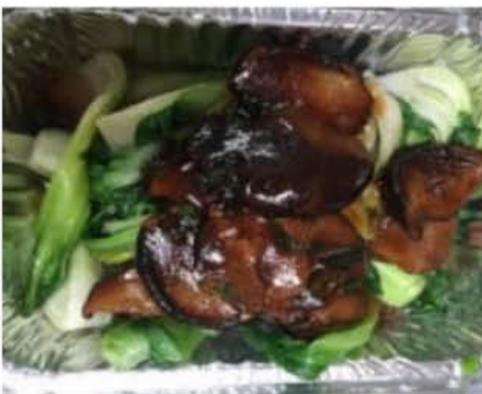
V08 香菇油菜 CHINESE BLACK MUSHROOMS WITH BABY BOK CHOY