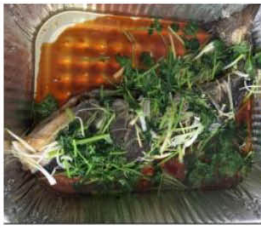
S06 清蒸黑雕鱼 STEAMED BLACK COD