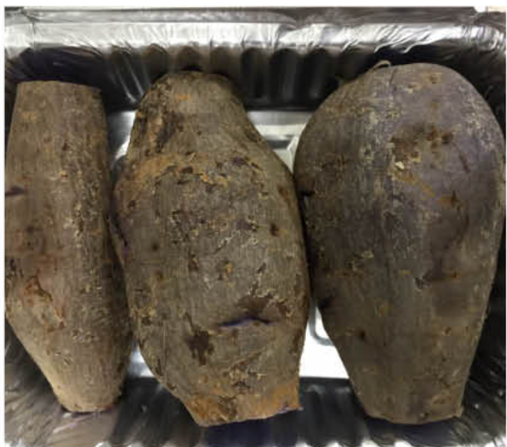
A25 蒸紫薯 STEAMED SWEET POTATOES (PURPLE)