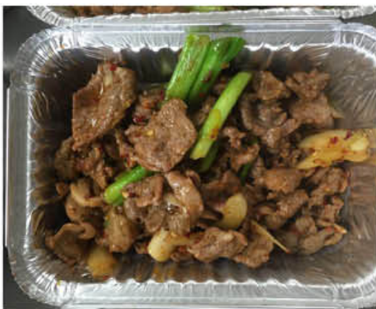
M02 孜然羊肉 LAMB WITH CUMIN