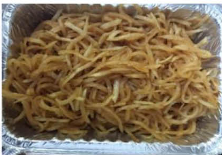
V28 腌萝卜丝 RADISH SALAD