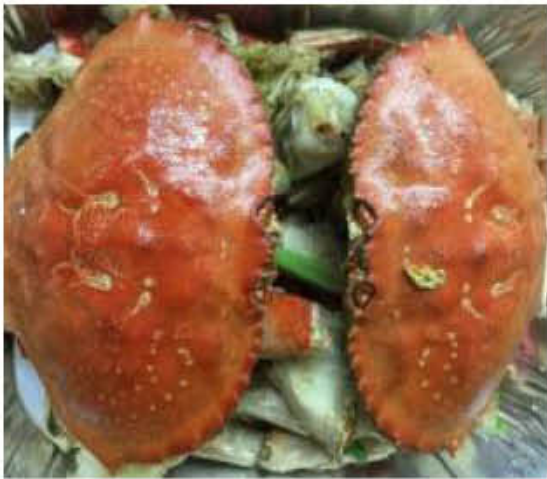
S02 珍宝蟹 DUNGENESS CRAB