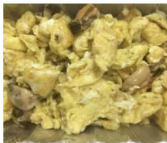
S13 生蚝鸡蛋 STIR FRIED OYSTER WITH EGG