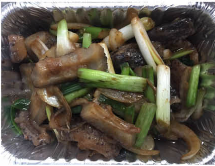
S15 葱烧海参 BRASIED SEA CUCUMBER WITH SCALLION