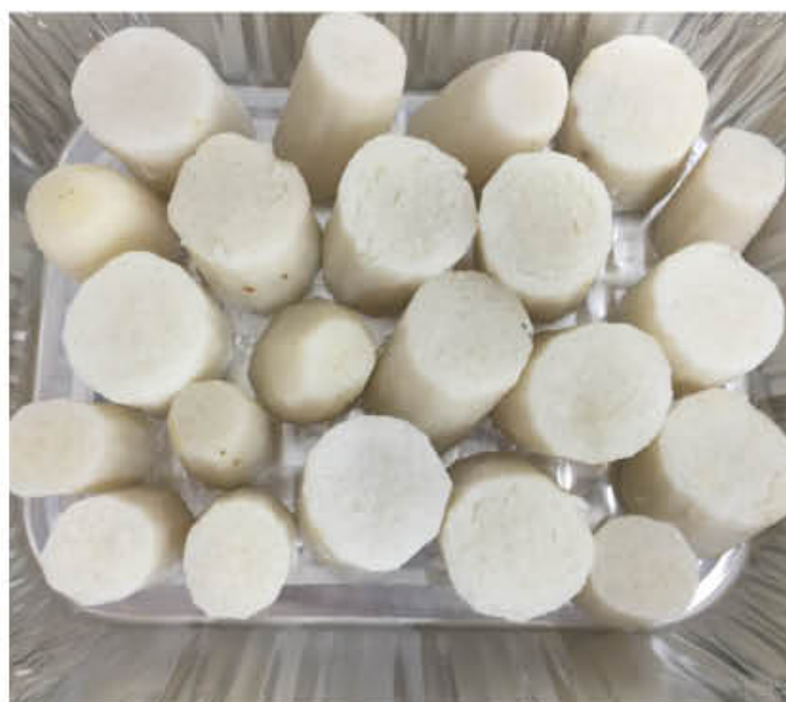
A26 蒸山药 STEAMED CHINESE YAMS