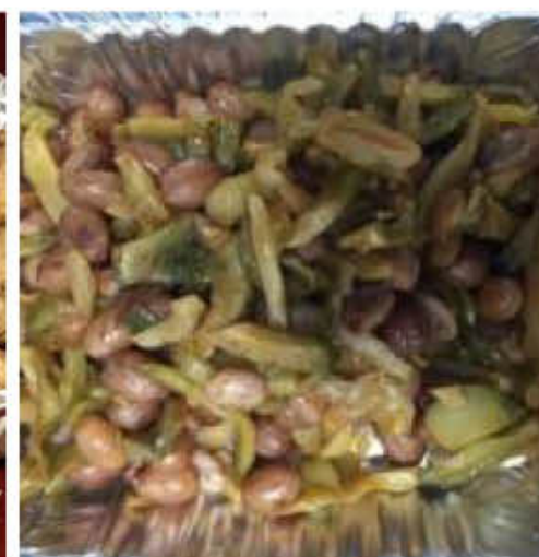
V32 咸菜 PICKLES WITH PENUTS