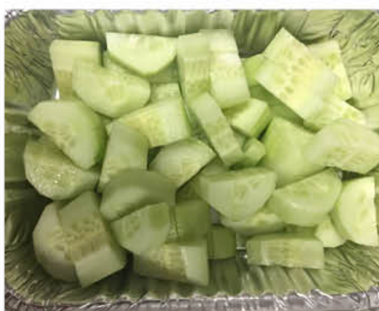
V36 凉拌黄瓜 CUCUMBER SALAD