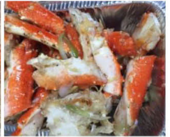
S04 葱姜帝王蟹腿 KING CRAB LEG (GREEN ONION & GINGER)