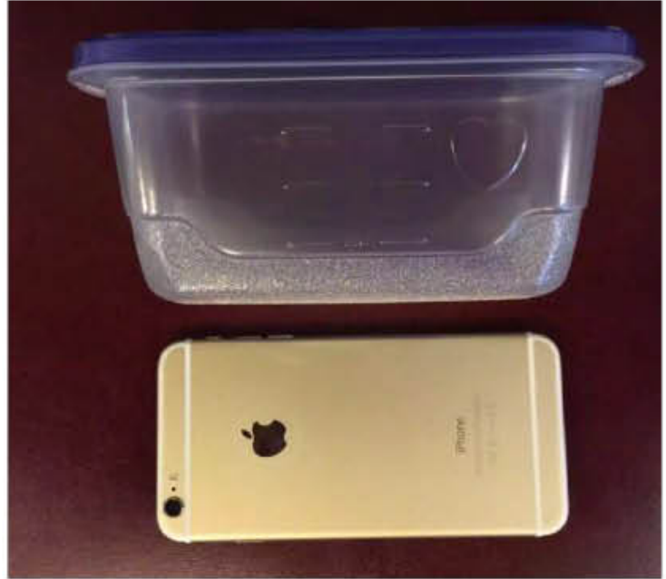
可微波一次性餐盒 (Microwavable Containers)