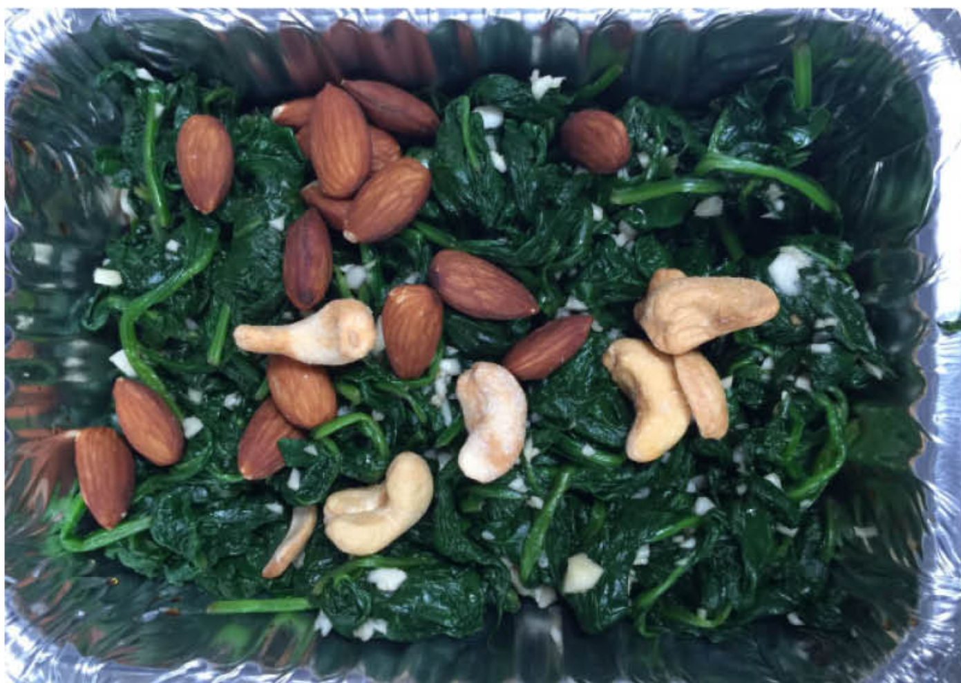
V35 菠菜坚果 SPINACH WITH NUTS