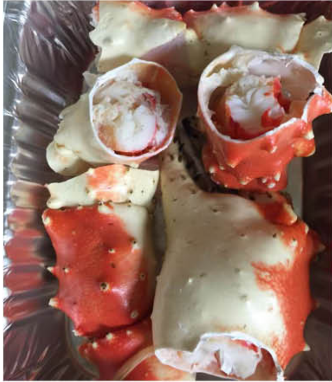
S01-1 清蒸帝王蟹腿 Steamed King Crab Leg