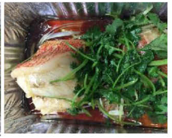
S07 清蒸石斑鱼 STEAMED ROCK FISH