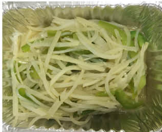
V06 青椒土豆丝 STIR FRIED SHREDDED POTATOS WITH GREEN PEPPERS