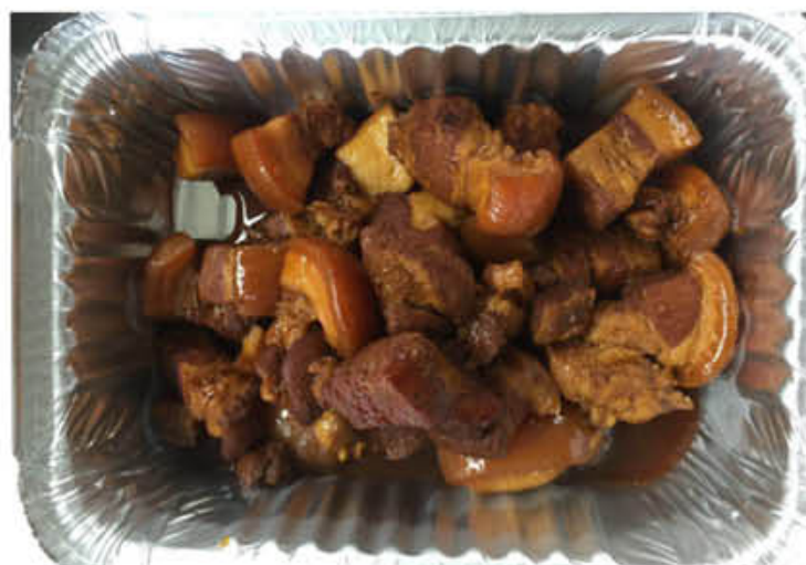
M12 红烧肉 BRASIED PORK WITH BROWN SAUCE