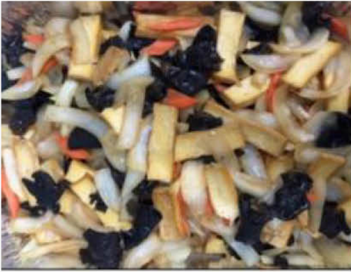
V03 洋葱香干 ONION WITH TOFU CURDS