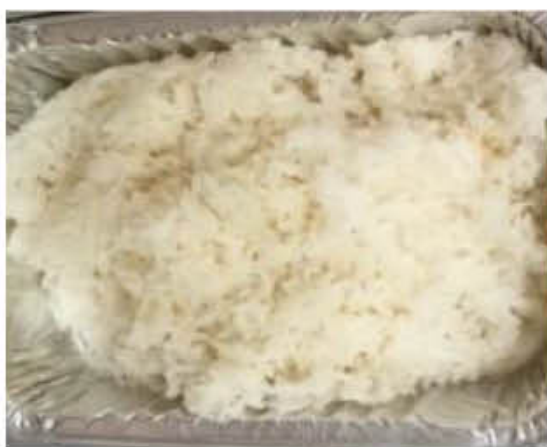
A02 白饭 STEAMED RICE