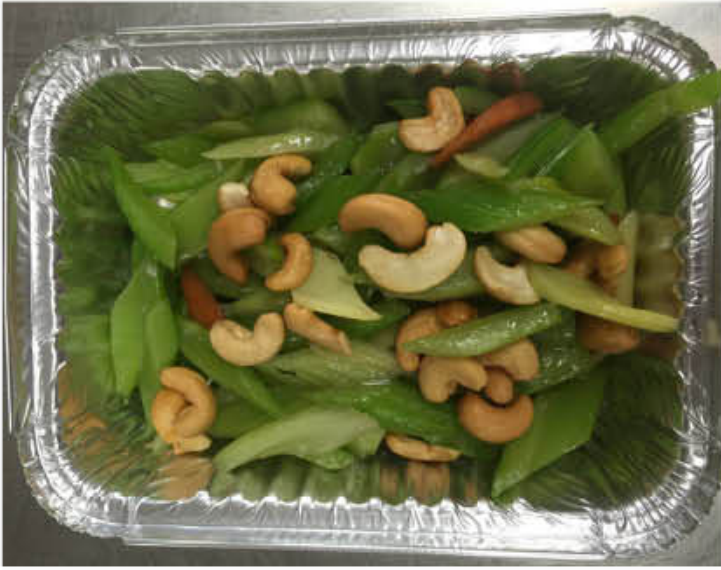
V01 腰果西芹 CASHEW WITH CELERY