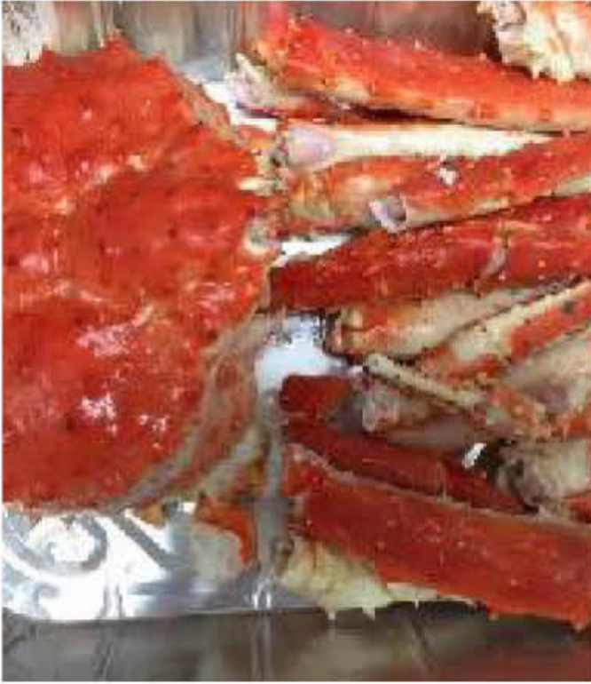
S01 清蒸帝王蟹 STEAMED KING CRAB