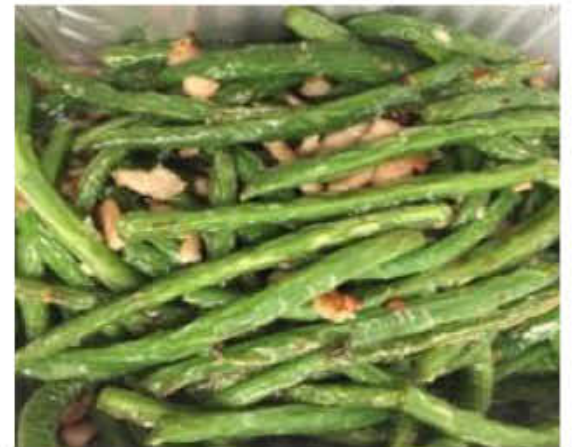
V07 干煸四季豆 GREEN BEAN WITH PORK