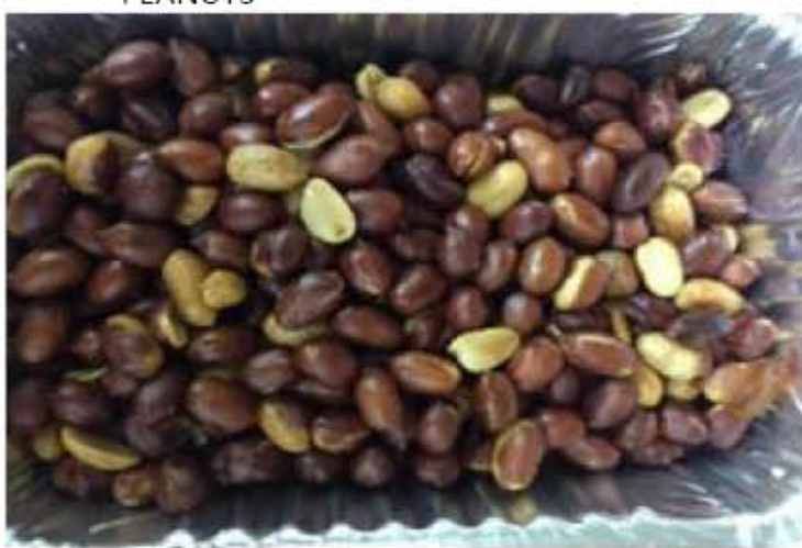
V33 炸花生米 DEEP FRIED PEANUTS