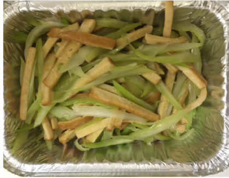
V02 芹菜香干 CELERY WITH TOFU CURDS