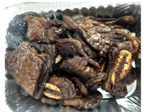
M04 牛仔骨 KALBI