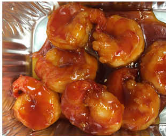
S20 干烧大虾 (去皮/带皮) SZECHUAN PRAWNS (PEELED/ WITH SHELL)