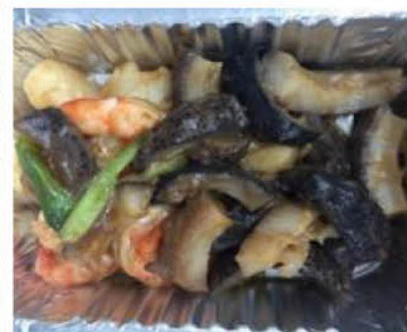
S14 烧三鲜 (鲜贝, 海参, 虾) THREE DELICACIES (SCALLOP, SEA CUCUMBER, SHRIMP)