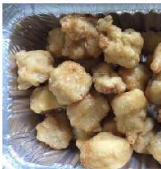
S10 椒盐比目鱼 SALT & PEPPER HALIBUT