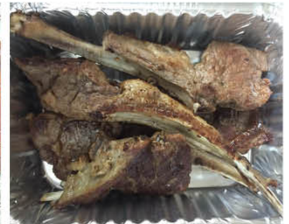
M01 烤羊排 ROASTED LAMB SHANK