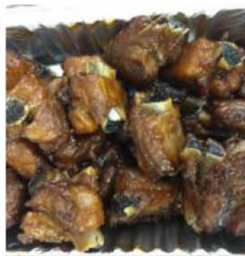
M08 糖醋排骨 RIB WITH SWEET & SOUR SAUCE