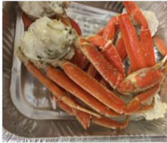
S03 雪蟹 SNOW CRAB