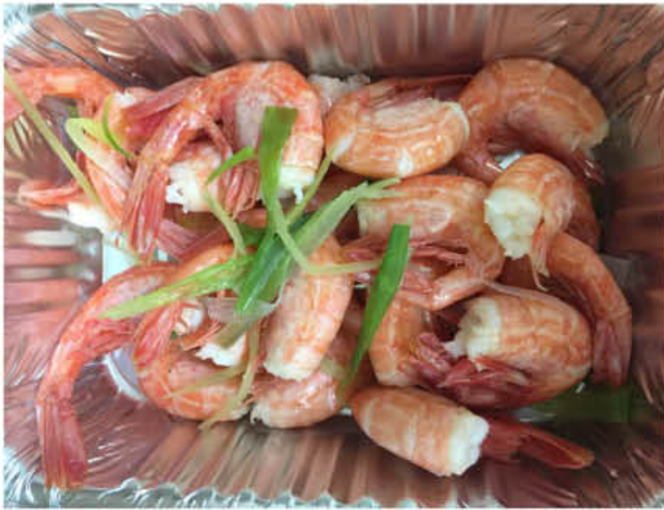
S17 阿拉斯加甜虾 ALASKA STRIP SHRIMP