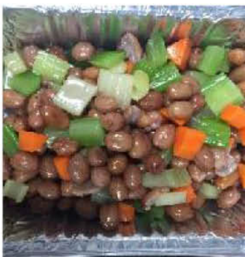
V30 什锦卤花生 VEGETABLE DELUXE WITH PEANUTS