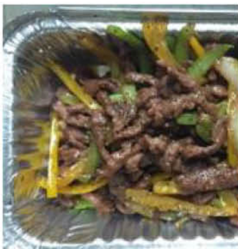
M07 黑椒牛柳 BLACK PEPPER BEEF