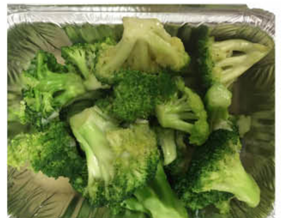
V10 蒜蓉西兰花 BROCCOLI WITH GARLIC SAUCE