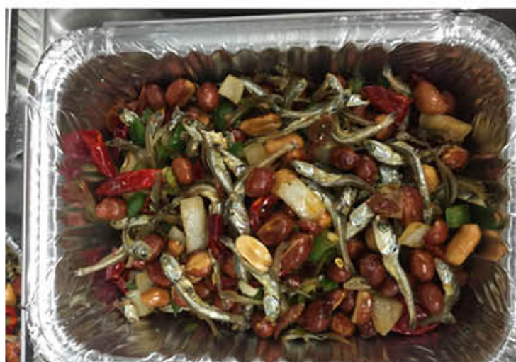
V34 小鱼花生 PEANUTS WITH DRIED ANCHOVIES