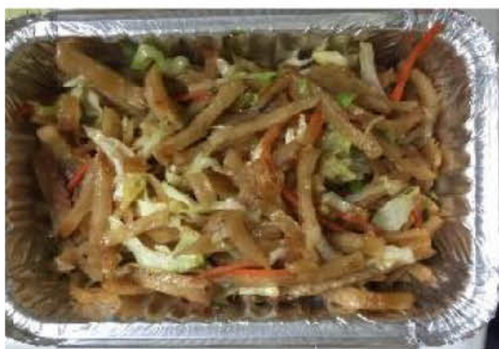
V29 炒榨菜 STIR FRIED CHINESE PICKLES